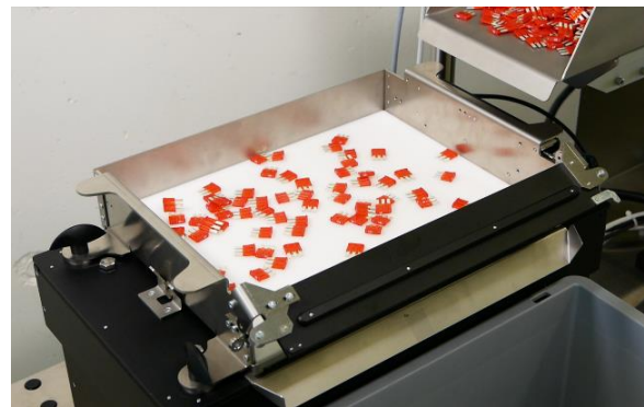
Asycube 380 with open purge platform